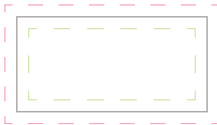
2" x 1" SQUARE CORNER MAGNET