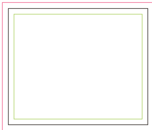
2.5" X 3" Square Corner Magnet